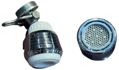
Kitchen and Bathroom Aerators