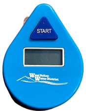
Minutero de ducha de cinco minutos