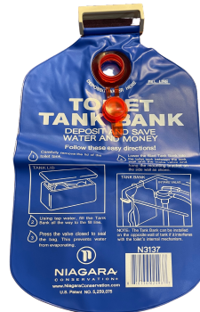
Banco de tanque de inodoro

**Los artículos enumerados están sujetos a cambios o pueden no estar presentes en función del inventario.