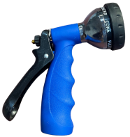
Automatic Shutoff Hose Nozzle.