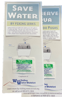
Tabletas de detección de fugas en inodoros