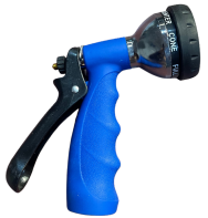
Boquilla de la manguera de cierre automático