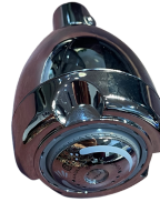
Cabezales de ducha con spray ajustable