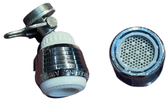
Aireadores de cocina y baño