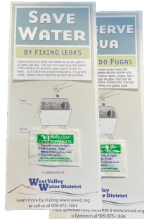
Toilet Leak Detection Tablets